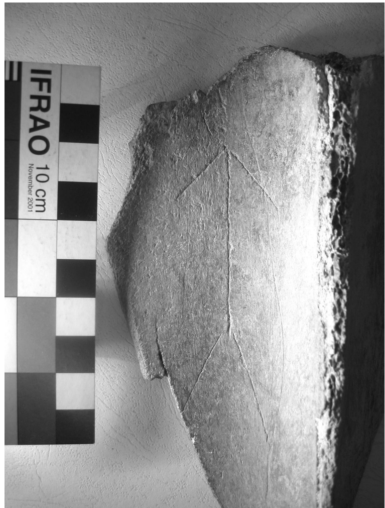
Figure 3. The engraved bone fragment No. 2 from the Oldisleben site.

The third engraved object from the Micoquian of Oldisleben is a flattish, rounded and heavily worn fragment of a large long bone of an undetermined species, 78.1 mm long, maximal 31.4 mm wide and 8.1 mm thick. The bone's compactness and superb state of preservation have helped to preserve the set of engraved grooves on its convex outer surface. Beginning from the left (Fig. 4) there are two short