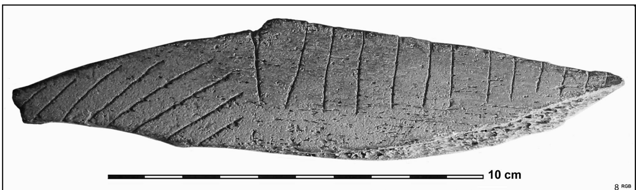
Figure 2. The engraved bone fragment No. 1 from the Oldisleben site.

The second find from the same site and deposit is in a cognitive sense even more significant, because it conclusively refutes a long-held view of many commentators on the cognitive evolution of hominins — that no evidence is available of structured symbols prior to the Upper Palaeolithic. A structured arrangement of five lines forming a recognisable graphic form (Fig. 3) occurs on a partially preserved shoulder blade of unknown attribution. The bone is 153 mm long and maximal about 103 mm wide, and its surface bears two taphonomic markings. The engraved design is placed much in accordance with the extant margins, but one of the five lines connects to the edge and runs slightly over it, so at least this margin predates the