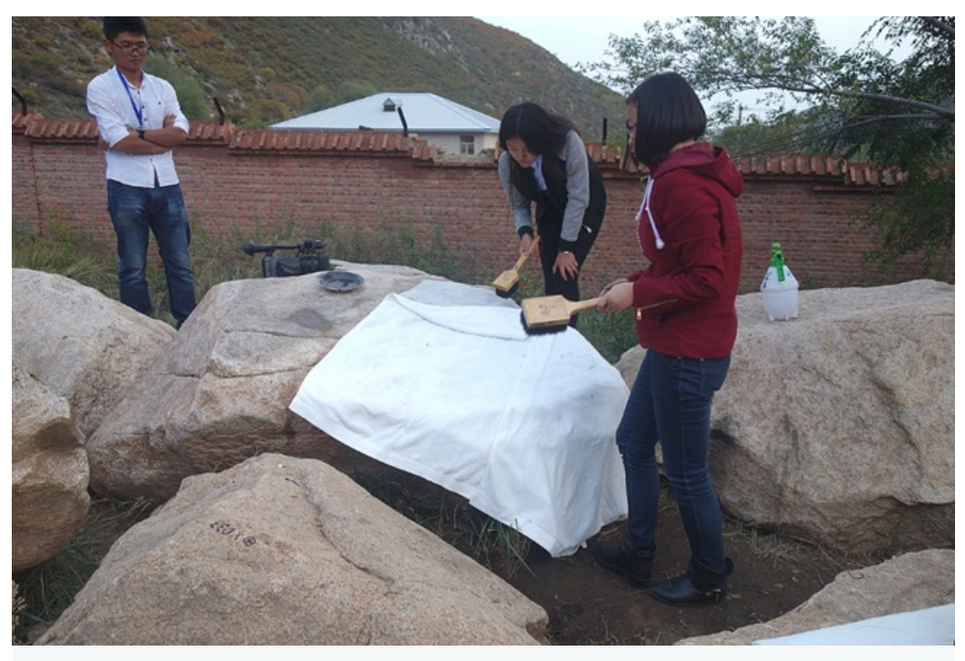
Figure 3. Stamping the paper mâché into place with stiff brushes.

It needs to be emphasised that all participants of the recording program earnestly believed in seeing the petroglyphs and that they still perceived petroglyph grooves even after their non-existence had been pointed out. Indeed, they were incredulous that the three specialists could not see them, and there was absolutely no collusion among the recorders to mislead deliberately. However, what is most astonishing is that not only did they 'see' the petroglyphs, but they also experienced similar, if not identical, designs. Yet the continuing investigation of the rock art specialists on the following days showed that of the several thousand petroglyphs recorded on the hundreds of blocks in the salvage yard, not even one existed. However, because of the intensive search and strenuous endeavour to detect the rock art others saw, after three days, the author began experiencing the sensation of seeing petroglyph grooves where blocks had been traced in black pigment when observing them from about two metres distance, but when he examined the effect closely the grooves 'disappeared'.