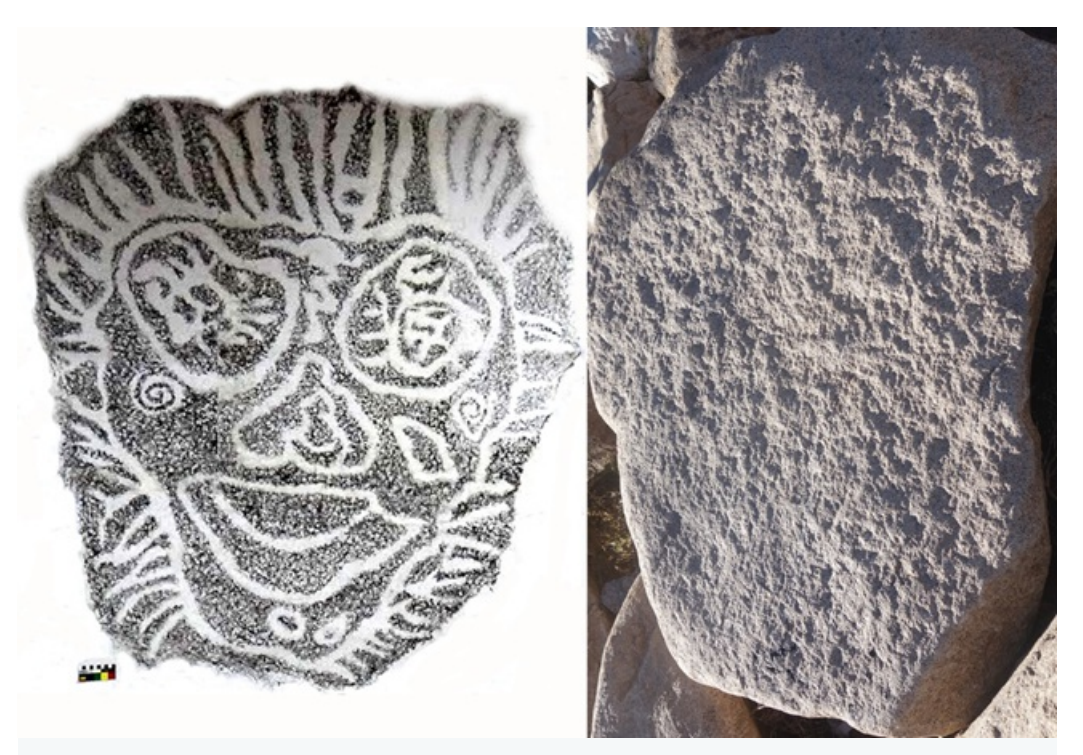
Figure 2. Recording taken from one boulder in the Xiaojinggou salvage yard, and view of the same panel in identical orientation.

Therefore, the specialists requested that the recording procedure be demonstrated. Two members of the recording team obliged, placing thick paper over a rock, spraying it lightly with water, covering it with a thick cloth and stamping the paper mâché into position with stiff brushes (Fig. 3). The cloth was then removed and the paper allowed to dry for an hour. Rather than by rubbing, the black pigment was then applied by stamping with small brushes, each of the two operators commencing from a different part of the panel. This is obviously much gentler than rubbing, and the objective was to emphasise rises in the surface and avoid depressions, as would be the case in rubbing. After several minutes, the recorders were asked to pause, and the specialists examined their work closely. There was no correspondence between depressions on the rock and blank areas in the pigment; the pigment had been applied independent of the surface topography. Amazingly, it had begun to outline blank areas, forming grooves that allowed a single design to emerge. All this had taken place without verbal communication between the two operators, who had commenced in unison to produce one of the stylised face arrangements. Other recorders were then asked to show the process of highlighting supposed petroglyphs with black paint, and again, it was entirely clear that their lines were not following any real grooves or depressions on the rock.